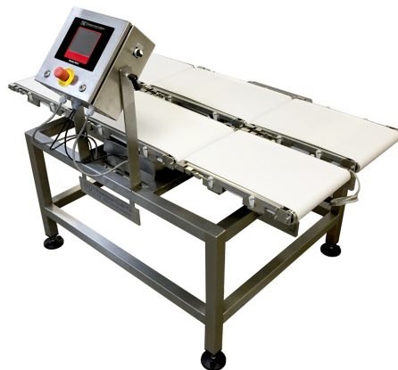
Dual-Lane Sonic 350SHD Checkweigher System