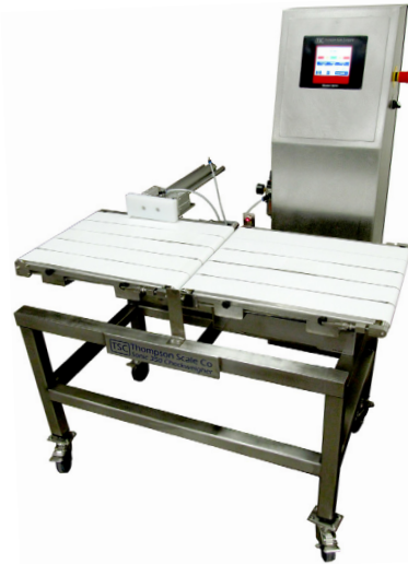
2-Belt Sonic 350SHD with Ram Rejecter

Weights from grams to 10 kg, rates to 220 per minute