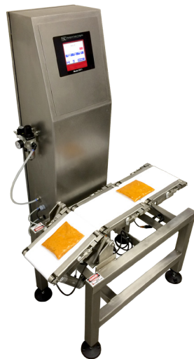
3-Belt Sonic 350MDR with Drop-Nose Rejecter